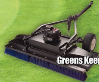
Greens Keeper II Brush