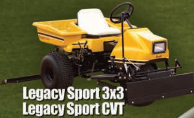
Legacy Sport 3x3 Legacy Sport CVT