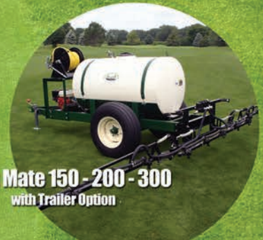
Lawn Mate 150 - 200 - 300 with Trailer Option