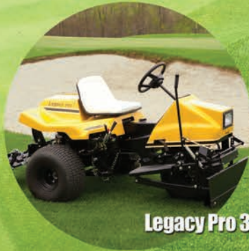
Legacy Pro 3x3