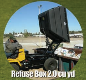
Refuse Box 2.0 cu yd