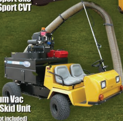
Stadium Vac Slide in Skid Unit (Vehicle not included)