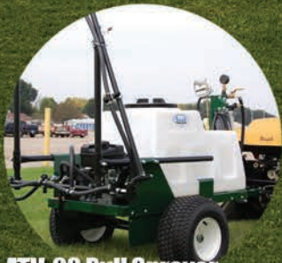
ATV-60 Pull Sprayer