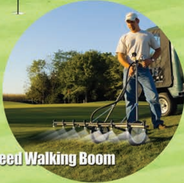
AccuSpeed Walking Boom