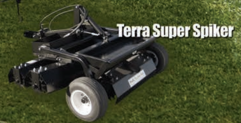
Terra Super Spiker