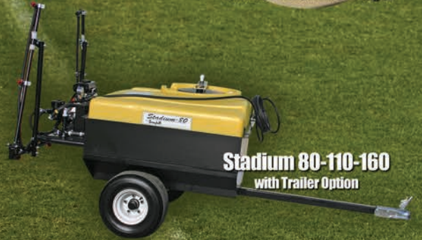
Stadium 80-110-160 with Trailer Option