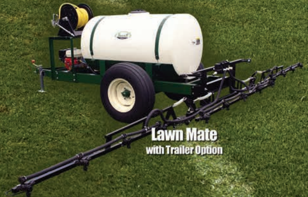
Lawn Mate with Trailer Option