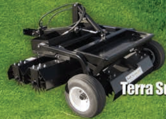
Terra Super Spiker