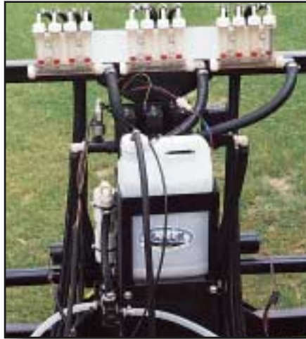
Optional Broyhill built foam marker mounts easily on the center section of all Broyhill turf booms.