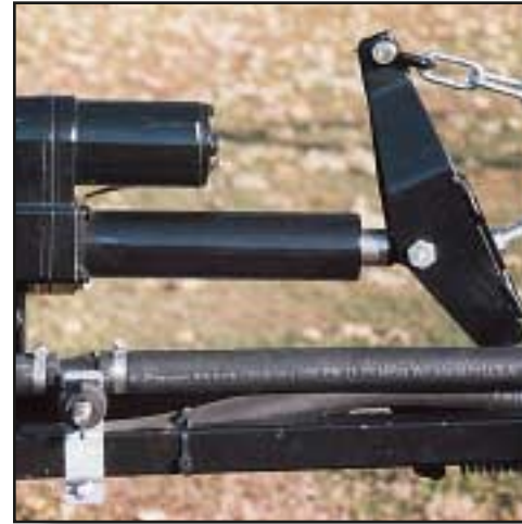
Heavy duty boom Actuator Lift Kit provides independent raising/lowering of outer wings on all Broyhill 3 section booms.