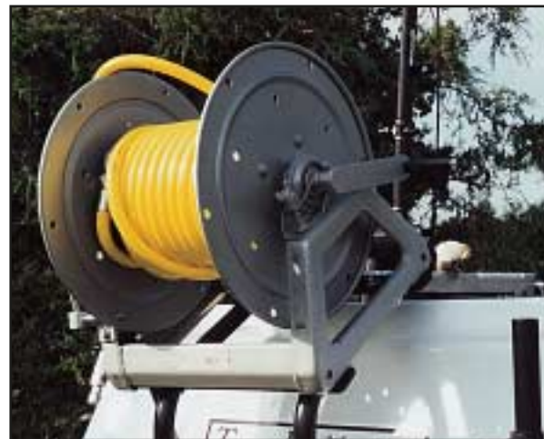
Manual or electric hose reels mount easily and accommodate up to 200 ft of 1/2" ID. high pressure hose.