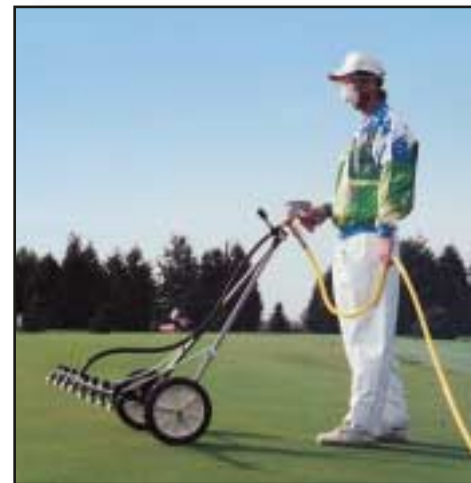
Accuspeed® Walk Boom provides safe & accurate chemical application, while monitoring speed, time & distance traveled.*

* Operator shown wearing Broyhill's EPA Safety Apparel.