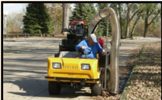
Stadium vac mounted on TerraSport CVT vehicle picking up leaves.