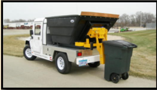
2 cubic yd. Refuse box mounted on E-ride electric vehicle.