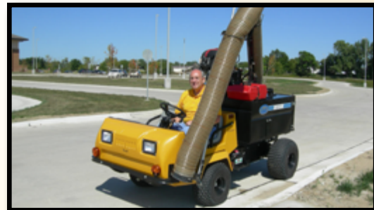
VacMate all-in-one unit (dedicated veh/vac).