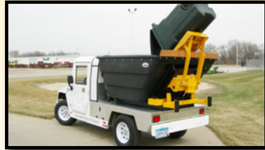
Can tipper picks up container (lowering work comp expense).