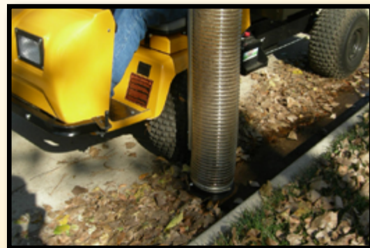
Vac close up cleaning street gutter.