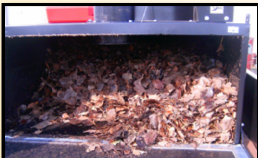
1 cubic yd. debris housing for Stadium Vac.