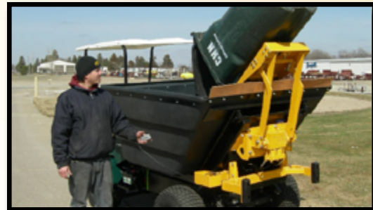
Same unit mounted on our TerraSport CVT vehicle.