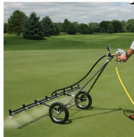
(Walking Boom Optional) I-1575D

Motorized ball valve kit features viton seals, poly ball and nylon stem, open to close in .75 seconds, rated at 300 psi/32 gpm. Kit includes ball valve, mounting bracket, necessary hardware and power cable. Available for Broyhill turf boom plumbing packages. When ordering ball valve kit with control package - deduct $395.00 retail for price of solenoids ( SSAA144A-3 ).