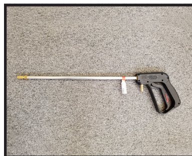
Spray wand with 25' hose is standard equipment.