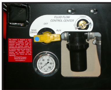
Safety Spray Control Center - all controls out of harms way.

GForce HP (High Performance) 15" fan sprayer - 18" housing 535# varies with tank size