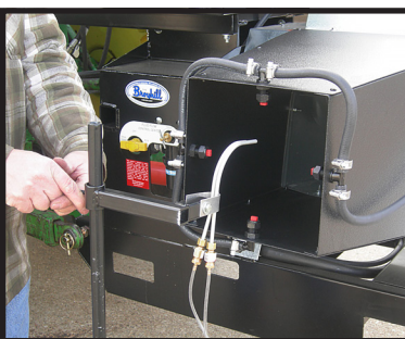
Testing for wind speed & any dead spots. None.