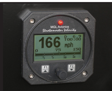
Air speed indicator testing during development.