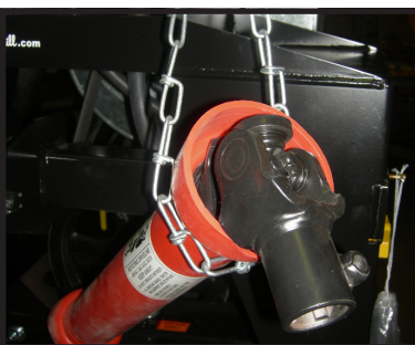
PTO Shaft Chain Hanger (when not in use) is standard equipment.