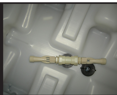
Dual jet agitation is standard equipment.