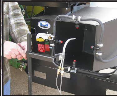
Testing for wind speed & any dead spots. None.