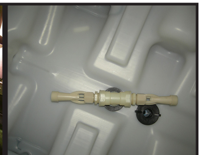
Dual jet agitation is standard equipment.