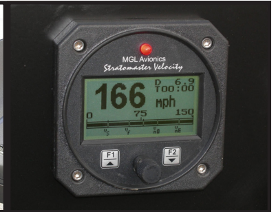
Air speed indicator testing during development.