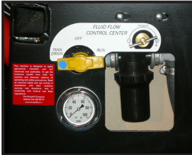
Safety Spray Control Center - all controls out of harms way.

GForce HP (High Performance) 15" fan sprayer - 18" housing 535# varies with tank size